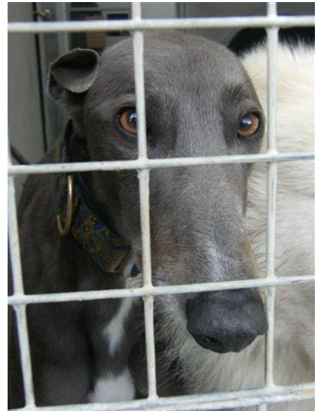
A racing greyhound in Ireland