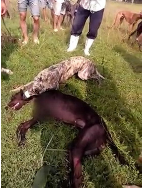
Dogs poisoned to death after racing in Vietnam

Once numbering over 100, Australia's tracks have continued to close. 88 Today, the country has sixty-five greyhound tracks, the most recent one closing in December 2016. 89