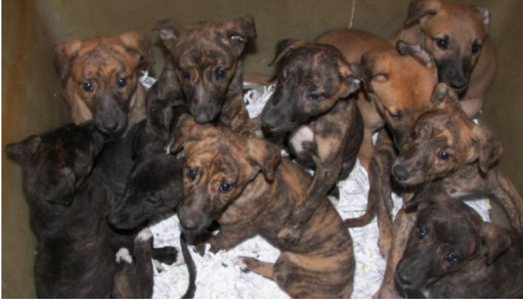
Puppies from a breeding farm in the United States

Vietnam, jurisdictions with no animal welfare laws in place. 12