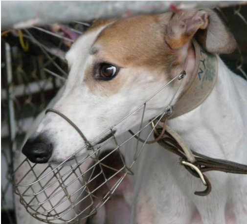
Brooklyn, a racing greyhound in Macau

Commercial greyhound racing exists in eight countries at nearly 150 tracks worldwide. 1 First invented in the United States, commercial racing is typically characterized by a regulating authority, state-sanctioned gambling, an industrialized breeding apparatus, a greyhound tattoo identification system, organized kennel operations, and a network of racetracks.