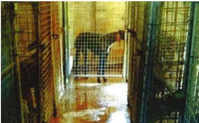
A greyhound in an Australian kennel

Greyhounds are “turned out” two to five times per day, depending on the jurisdiction. At the Canidrome in Macau, dogs are let out twice a day to relieve themselves but stay in their cages for upwards of twenty-three hours a day. 15 In the United States, dogs are confined for twenty hours or more with intermittent turn outs and races about once every four days. 16