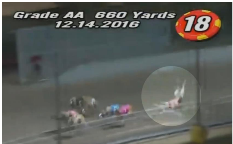
A dog falls at a race track in the United States

At dog tracks worldwide, greyhounds routinely suffer serious injuries. However, only a few jurisdictions regularly publish injury data. The racing commissions of the American states of Arkansas, Iowa, Texas, and West Virginia produce injury data subject to public request, and the Australian state of New South Wales started publishing injury data in late 2015. Reported injuries include broken legs, crushed skulls, seizures, paralysis, broken backs, and death by electrocution.