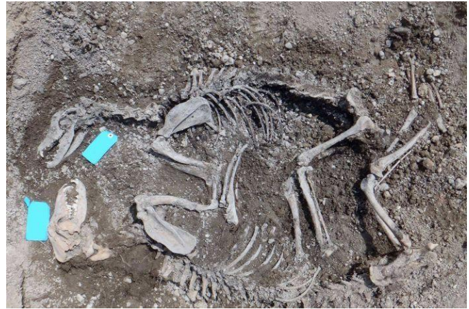
Greyhound skeletons in a mass grave in Australia

In New South Wales, Australia, a 2016 Parliamentary investigation into the greyhound industry revealed evidence that suggests as many as 68,448 greyhounds had been killed over a twelve-year period because “they were considered too slow to pay their way or were unsuitable for racing.” 25 A few days after this analysis was released, a greyhound mass grave was discovered at the Keinbah Trial Track near Cessnock. 26 Almost 100 greyhounds had been killed there “with a blow to the head, from either a gunshot or a blunt instrument.” 27