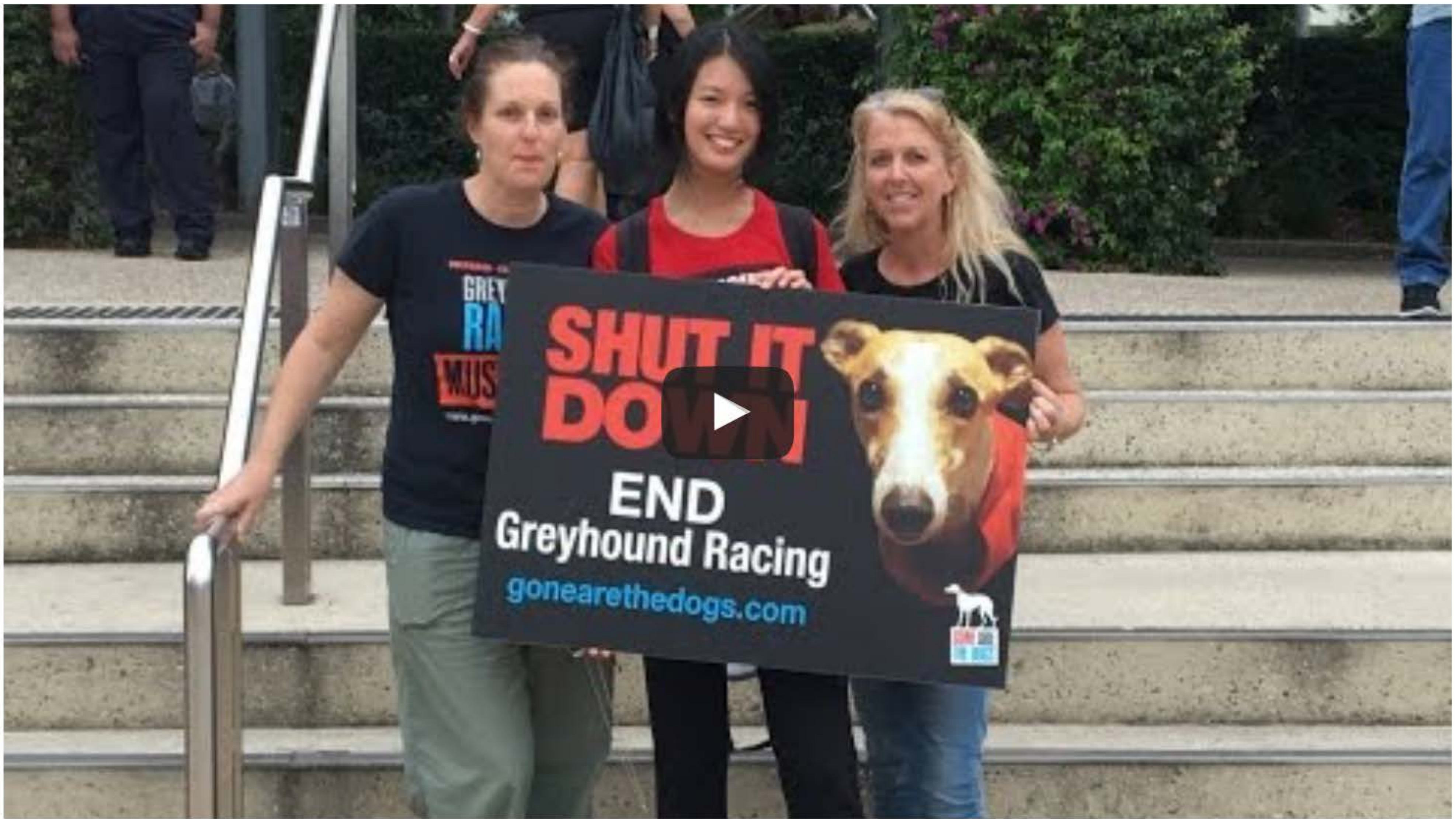
Oddities e-Club Magazine Video of the 'Shut It Down End Greyhound Racing'