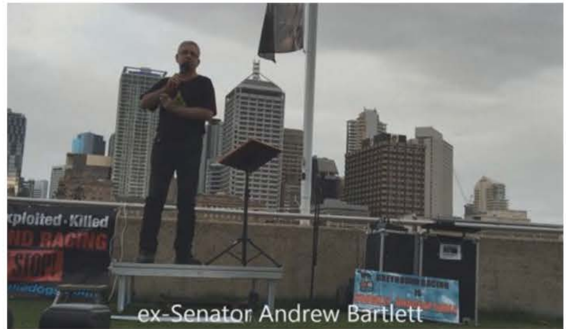
Andrew Bartlett (ex-Democrats Senator)

his speech - I was expecting something very dry with lots of statistics, and the usual politician avoidance of issues, however, what we got on this day was a passionate plea to help these animals, and a follow-up plea to not forget this message once the protest was over. Message received Andrew.