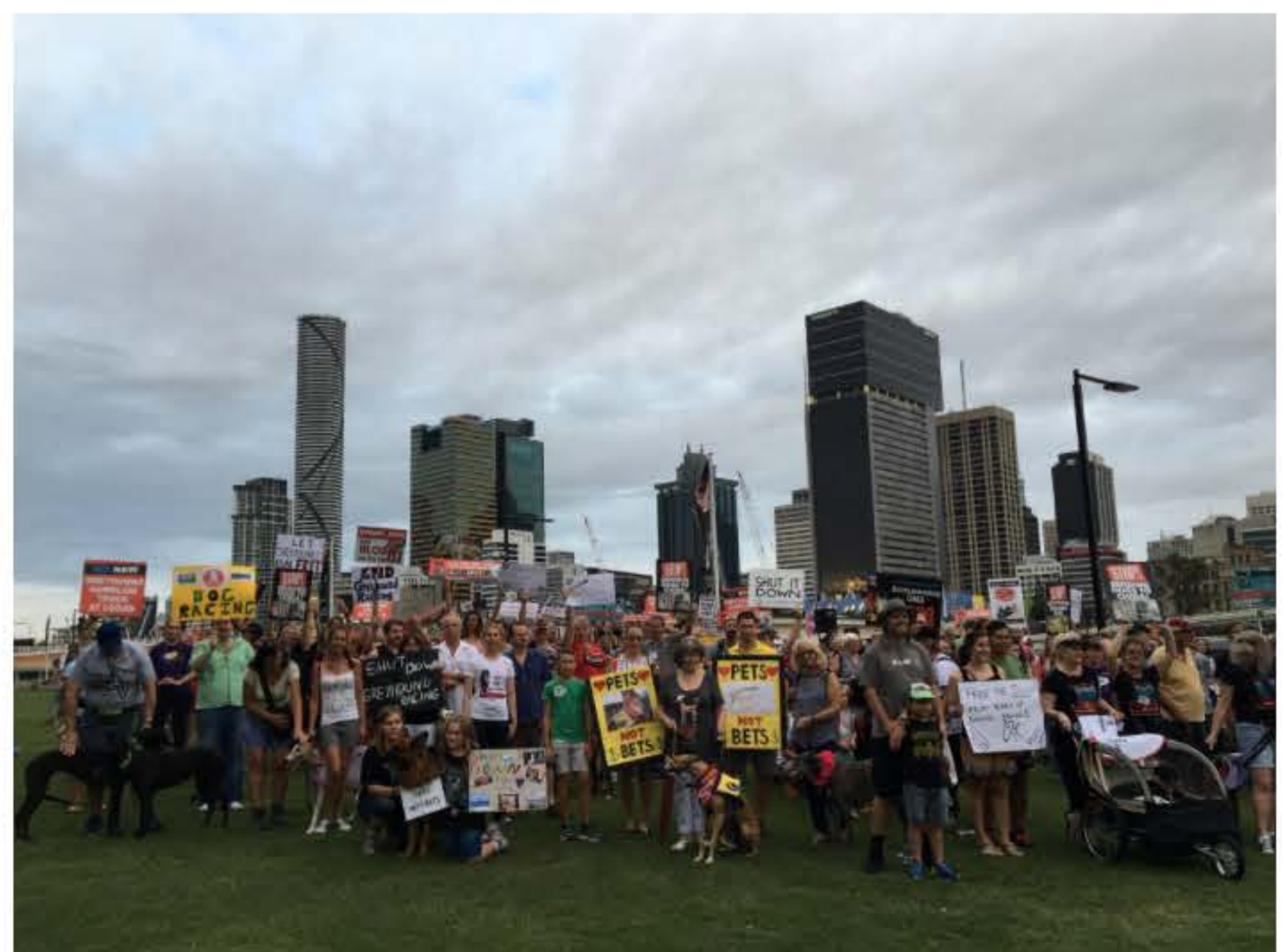
Over 600 Brisbanites came out in support